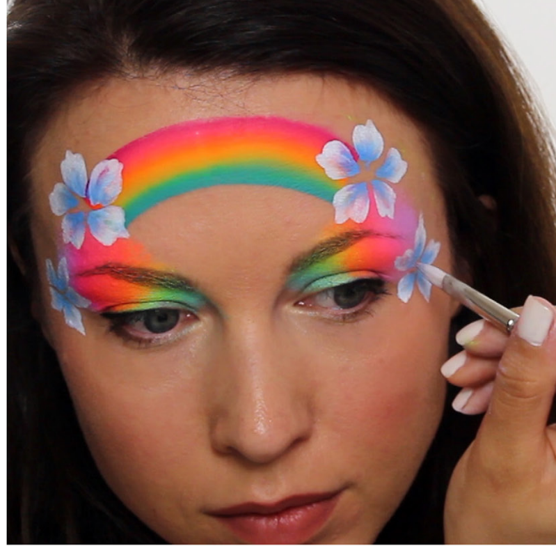
2- Flora 8 Brush - Double load your brush with white and blue. Create two large flowers at the base of the rainbow. Press the brush down twice for each petal and then turn it on its side to add the point. Add two smaller flowers at the outside corners of the eyes, this time only press once for each petal before adding the point.