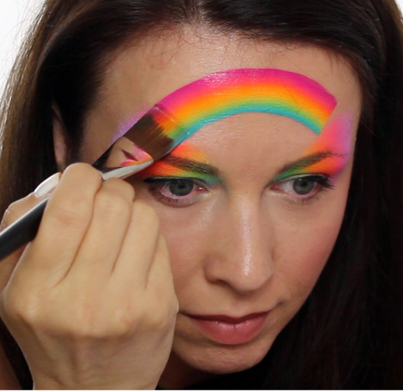
3 - 3/4" Flat Brush. Use a sponge to fill in the eye area with your chosen rainbow cake. Use a splitcake to paint a rainbow over the forehead