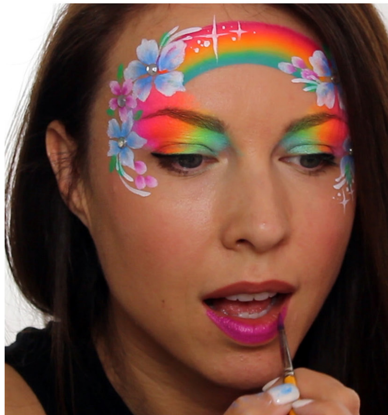
4 - No. 1 Liner Brush - Place white teardrops around the design in groups of 3 or 5. Add star bursts and dots to the rainbow and cheek. Stick small gems to the centre of each flower. Add lipstick