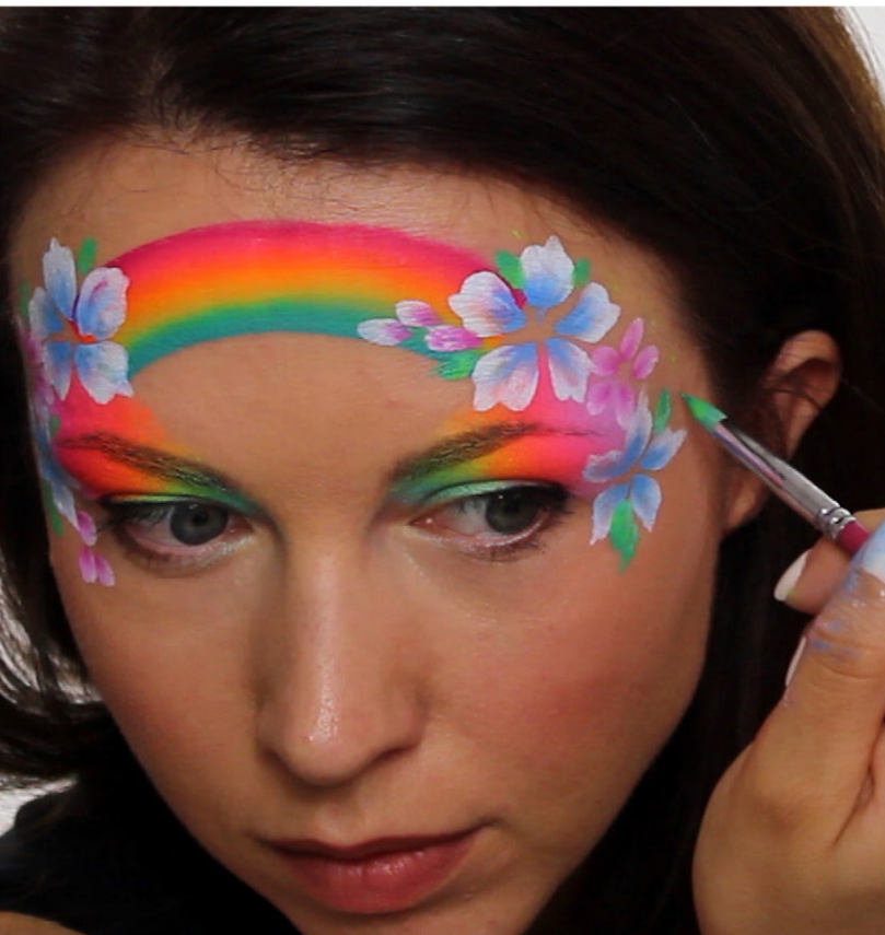
3 - Pretty Petal Brush - Double load your brush with white and pink. Paint a flower in between the blue flowers. Add some trailing petals above and below the eyes. Use green to paint the leaves