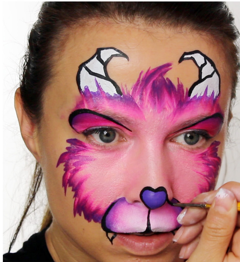
4 - Round No. 2 Brush - Use black to outline the horns and eyelids. Connect the nose down to the top lip and round out the bottom. Outline the muzzle. Paint two small teeth at the outside corners of the mouth. Outline the nose. Add some dots around the muzzle