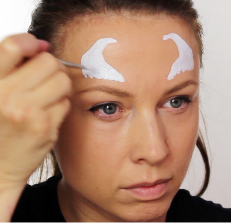
1 - Round No. 4 Brush. Use white to paint in the horns on the forehead