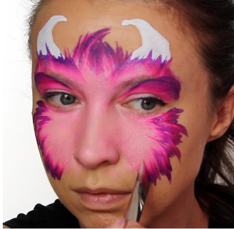
2 - 3/4" Flat Brush - Use your choice of splitcake to paint in the tuft of fur in the middle of the forehead. Cover the base of the horns with fur. Cover the eyelids. Connect the underside of the eyes to the corners of the mouth. Use a sponge and a matching colour to blend everything into the centre of the face.