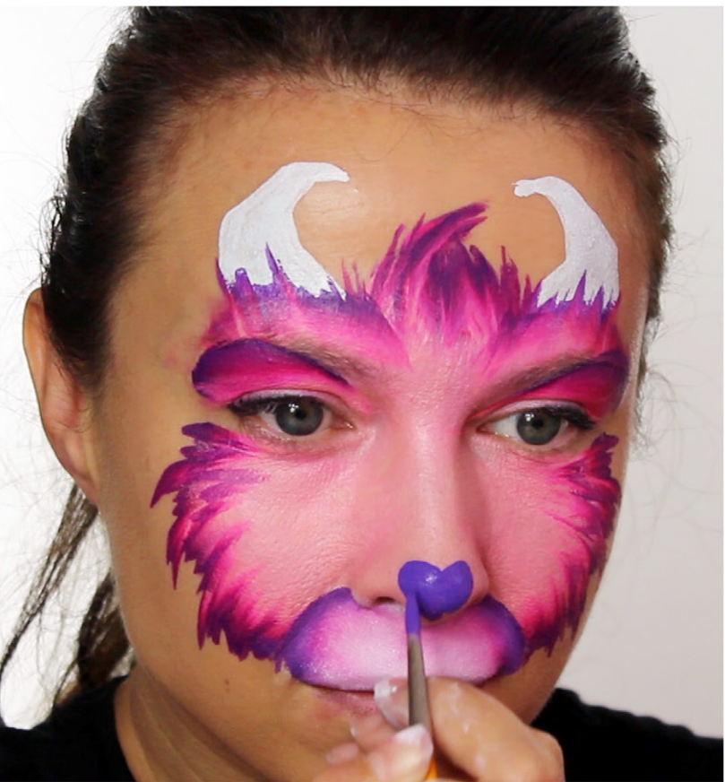
3 - Use white on a sponge to fill in the area between the nose and the top lip. With the same brush and splitcake as before outline the muzzle and blend the inside edges with the white sponge. Use a solid colour to paint a heart shape on the nose